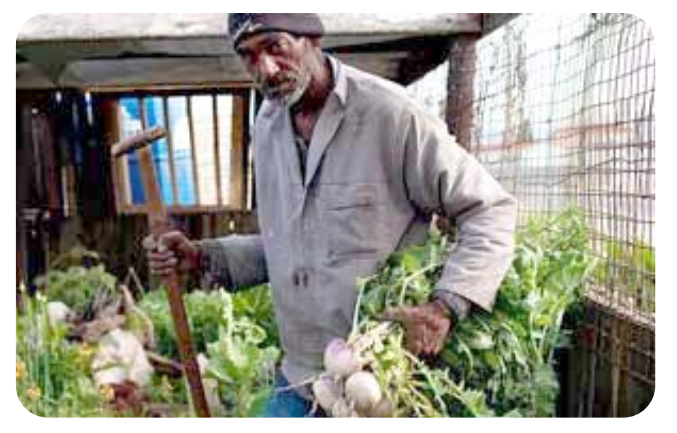
Civil society organisations have supported urban gardening in Cape Town's informal settlements during the pandemic through online training and sharing information via WhatsApp.