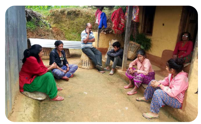
Dalit communities (also known as 'untoucables') in Kunni Kharka, Nepal, used collective savings and strengthened community bonds to tackle the Covid-19 crisis.