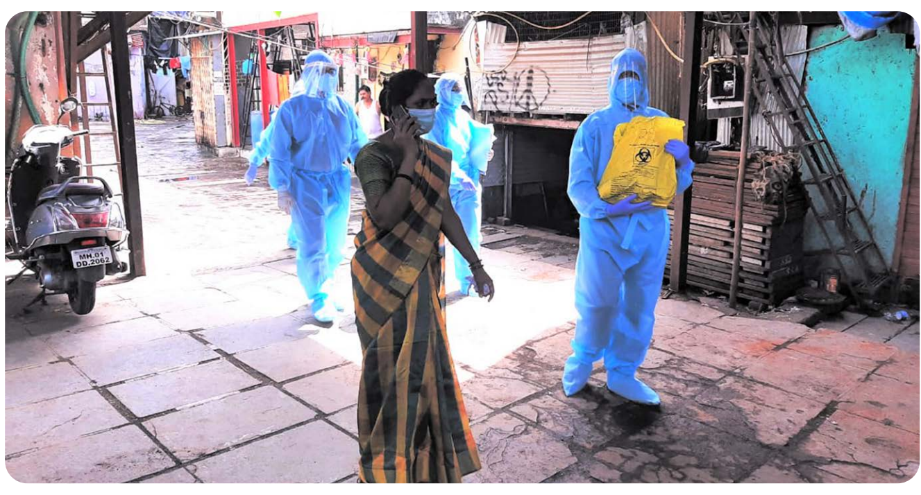
Dharavi, an informal settlement in Mumbai, India, was recognised as a special zone due to its high population density and inadequate basic services.