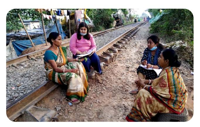
Residents of informal settlements in Guwahati, India, worked together to spread awareness for responding to both Covid-19 and monsoon floods.

Invest in literacy, education and advocacy skills at the community level so that community members may articulate more effectively to policy-makers what they want and need. As Sheela Patel of Slum Dwellers International (SDI) reminds us, 132 "We haven't yet invested in making local communities make representations on what they want."