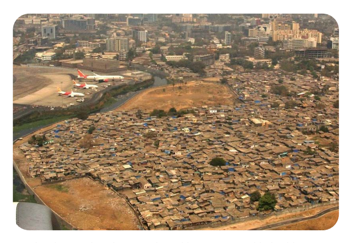
Mumbai slums, India, where Covid-19 adds to existing public health issues already faced by its residents.

Many Covid-19-related interventions undertaken by community organisations and NGOs, as well as individuals were in the form of "grants, internal cash resources, cash donations and in-kind contributions from civil society and organs of government, such as donations of food and food ingredients, cleaning supplies and protective equipment (masks) etc. In