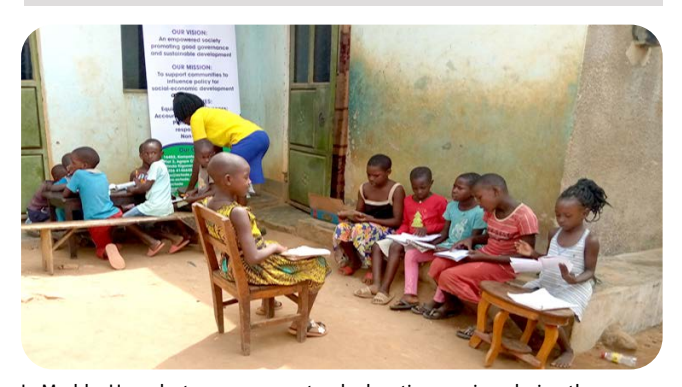
In Maddu, Uganda, two women extend education services during the Covid-19 pandemic to ensure a bright future for the children.