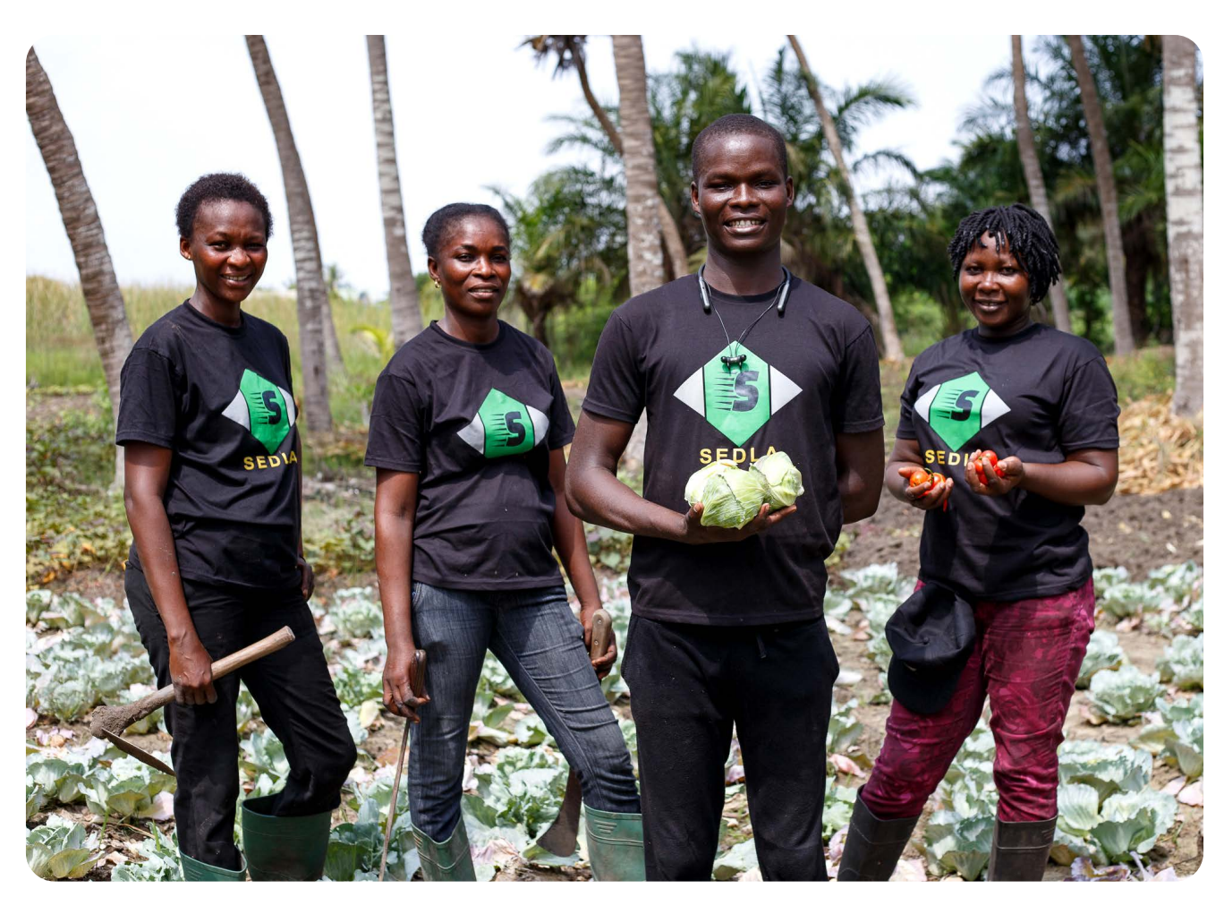
Young people created a new Ghanaian agribusiness during the pandemic, which aims to be climate-smart, too.

Each chapter provides insights into specific challenges posed to the advancement of key SDGs at community level: SDG1 (end poverty), SDG2 (end hunger), SDG3 (healthy lives), SDG5 (empowerment of women and girls), SDG6 (clean water and sanitation), SDG8 (decent work and economic growth), SDG13 (climate action) and SDG17 (partnerships). The chapters describe, through anecdotes, how local people's ingenuity and coping actions are delivering on these goals in the short-term, and what external support is needed for longer-term solutions. A cross-cutting chapter at the end considers the roles of appropriate finance, innovation and political empowerment to achieve development progress. A final chapter provides conclusions and recommendations for the global community, particularly in light of COP26 and the UNFCCC process, the Global Platform on Disaster Risk Reduction and the UNDRR process.