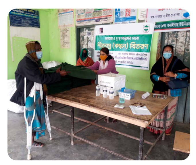
A women-headed organisation, Nari Associate for Revival and Initiative (NARI), distributes food and hygiene kits in the Kurigram district of Banqladesh.

Adaptive capacities go beyond just the assets and income at people's disposal and is also about "recognising the importance of various intangible processes: decision-making and governance; the fostering of innovation, experimentation and opportunity exploitation; and the structure of institutions and entitlements." (Jones et al, 2010)<sup>125</sup>