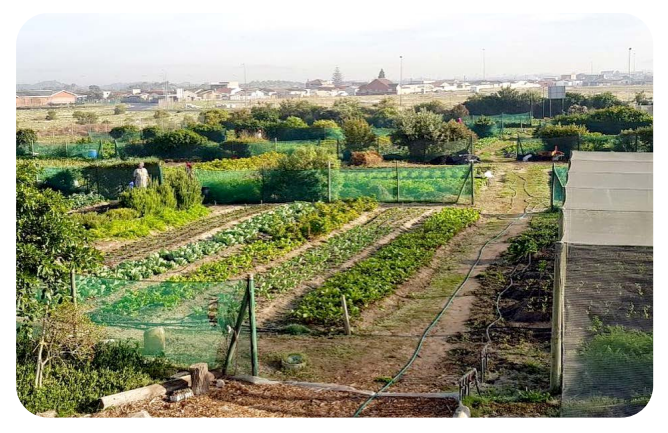
In Cape Town, South Africa, civil society organisations have stepped up their efforts to ensure food security by supporting small-scale farming during COVID-19.