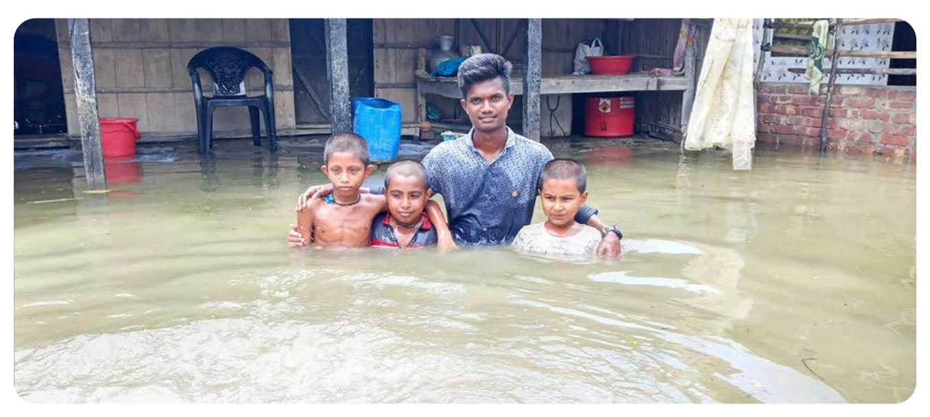
A man with his family following Super-Cyclone Amphan in Satkhira in southwest Bangladesh.