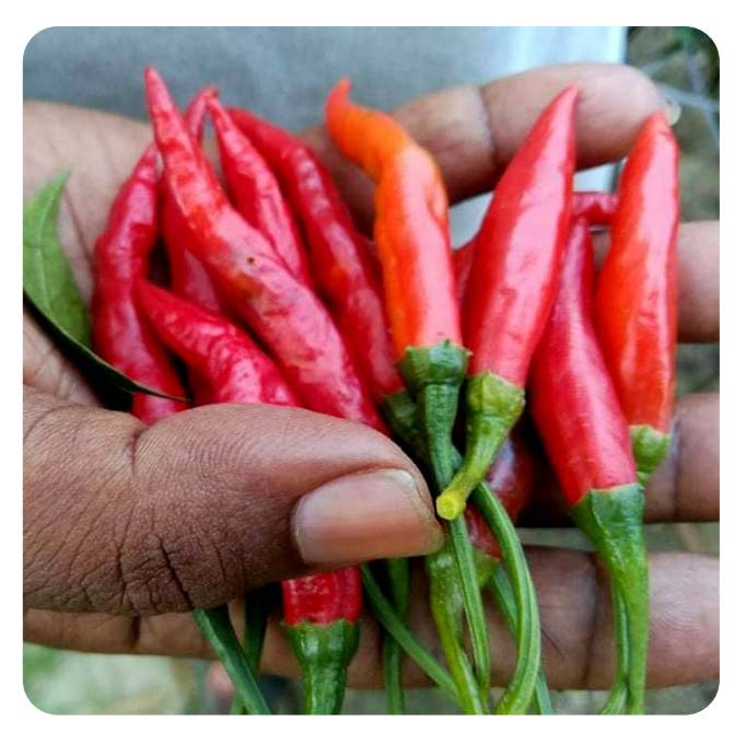
Prakritik Krishi's emergency fund enabled collaboration between farmers through the exchange of seeds, and provided fertilizers and basic food supply to farming communities in Bangladesh during the pandemic.

Keeping markets open. In Dhaka, Bangladesh, 88 the rapid spread of Covid-19 and a related lockdown broke the supply chains from farms to urban markets. This decision not only stopped the farmers' income, making them worse off, but also affected food supplies in the city. One organisation's answer was to liaise with the authorities to create a temporary, make-shift vegetable market near the village mosque to serve the local community. The idea was initially opposed by the local administration for fear of breaching social distancing protocols. But the farmers persisted with their efforts, and it was agreed that community police would be appointed to enforce and monitor social distance measures so that the market could operate.