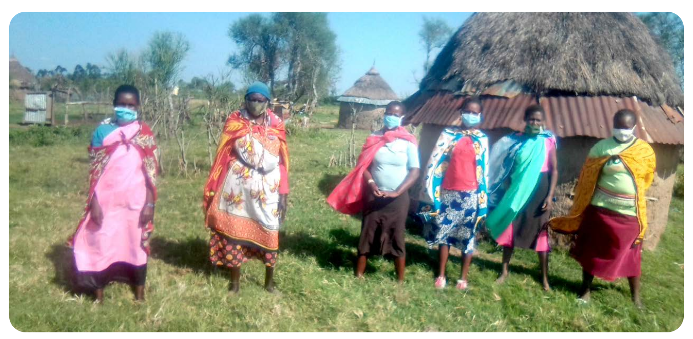
In Kenya, indigenous women are tapping into local resources, and undertaking individual and collective initiatives to tackle the Covid-19 crisis.

role in keeping girls in school and less vulnerable to domestic violence and sexual coercion.