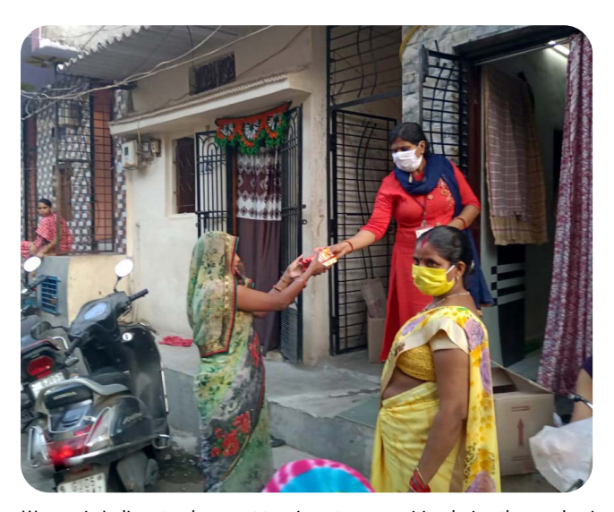
Women in India extend support to migrant communities during the pandemic. Mahila Housing Trust

People whose lives were economically precarious were easily overturned by the turbulence of the Covid-19 pandemic and governments' measures to address it. In India, for example there are 42 million internal migrants. An astonishing percentage of major cities comprises migrants (Ahmedabad: 46 percent; <sup>11</sup> Surat: 64.6 percent; Delhi 42 percent) and they consequently make up over 50 percent of the cities' workforce. However, when the Government of India declared a national lockdown in March 2020, migrant labourers, who depend upon daily casual jobs, suddenly found themselves jobless overnight. <sup>14</sup>