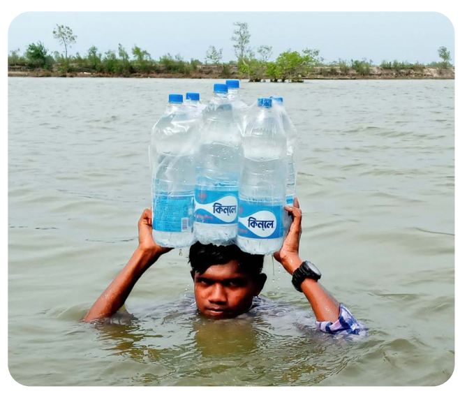
A man swimming through flood waters from Super-Cyclone Amphan in Satkhira in southwest Bangladesh.

"This time the floods approached without any warning, and the flood level exceeded twice the level it had crossed earlier," Bindu explained. "Also, the pandemic and subsequent lockdown left people with no money to buy bamboo and raise the platforms of their houses, forcing them to survive sleepless nights under those shelters." They were furthermore terrified by the risk of landslides. The increasingly crowded conditions in the shelters and reduction in sanitary facilities increased the residents' potential exposure to Covid-19.