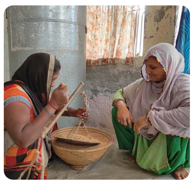
Women in Uttar Pradesh, India, use community grain bank services to grow their own vegetables and ensure food security during Covid-19.