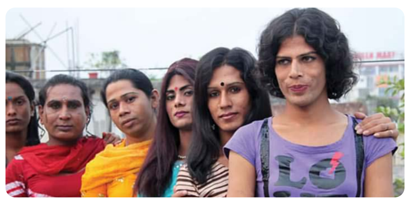
Individuals from the Hijra community in Dhaka, Bangladesh. The community has faced increased victimisation, exclusion and economic hardship during the Covid-19 pandemic.

Using Covid responses to leverage women's empowerment. Some women tell how they are using the extraordinary circumstances of the coronavirus pandemic as leverage to push for more public-facing roles for themselves and other women. Ms Chesengei and Ms Namalwa of the Mount Elgon, Kenya, area have decided to come out fighting against gender-based discrimination and to confront taboos about women's roles, as they rise to the challenge of the pandemic.